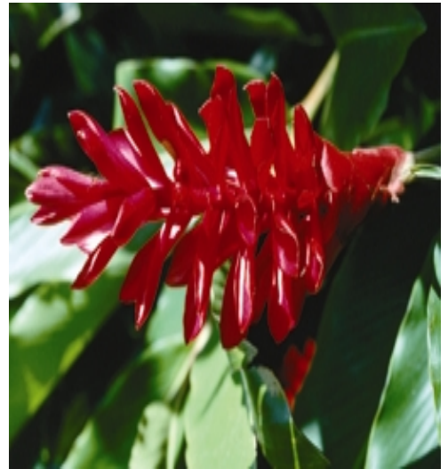
The ginger plant has many medicinal uses.

While ginger has no known side effects, it's always a good idea to consult your health care practitioner to make sure it's right for you.